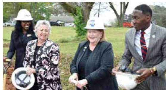
City officials break ground.

The $12.1 million, 23,000 square-foot building will be right near Todd Law's backyard on Smith Street on the west end of Lee Street Park and will include the courthouse, police department, probation offices, community room,