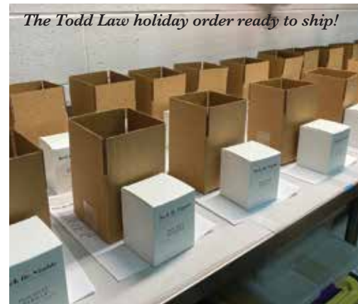
The Todd Law holiday order ready to ship!

Jack Be Nimble candles are sold in over 50 shops across the United States – many of which are right