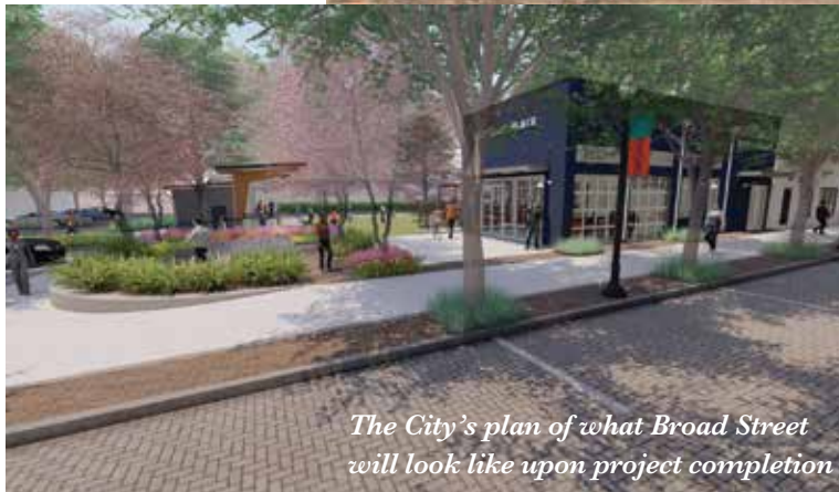
The City's plan of what Broad Street will look like upon project completion