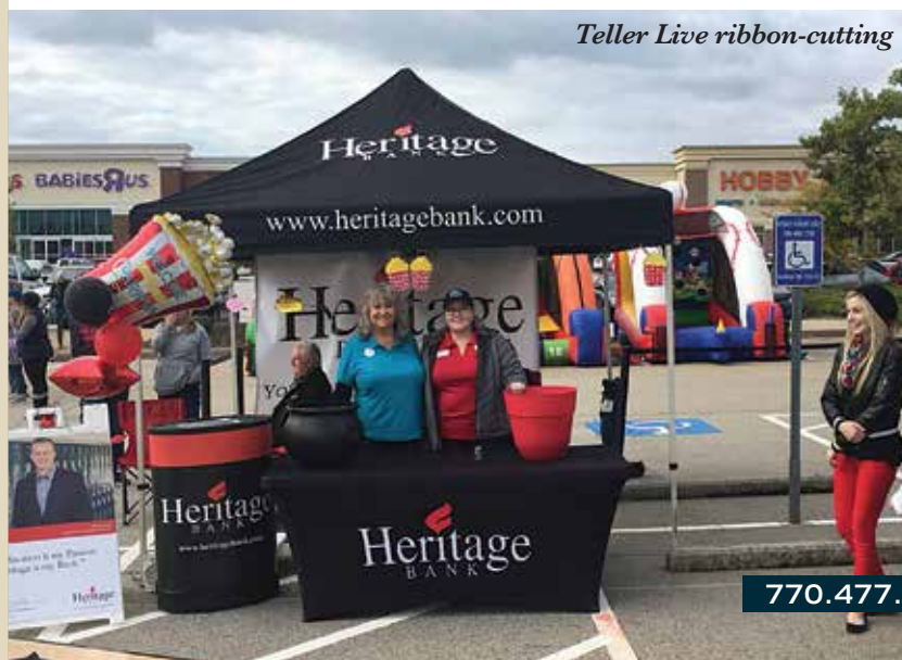
Teller Live ribbon-cutting