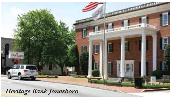
Heritage Bank Jonesboro

Technology has made it easier and easier for people to do all of their banking online and never have to be in front of a teller. We are so thrilled with Heritage Bank and the customer service they provide that we would gladly opt to work with them in person.