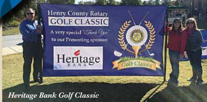
Heritage Bank Golf Classic

simplified transactions, and the ability to speak with a representative via video chat. They also have a fantastic, monthly electronic newsletter that offers readers a wealth of information on financial security; health and wellness, and family matters. To sign-up, simply visit https://www.bankadviser.com/heritagebank/ and click "subscribe". Thank you for all you do for our community, Heritage!