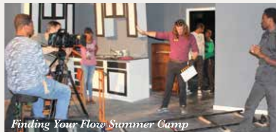
Finding Your Flow Summer Camp