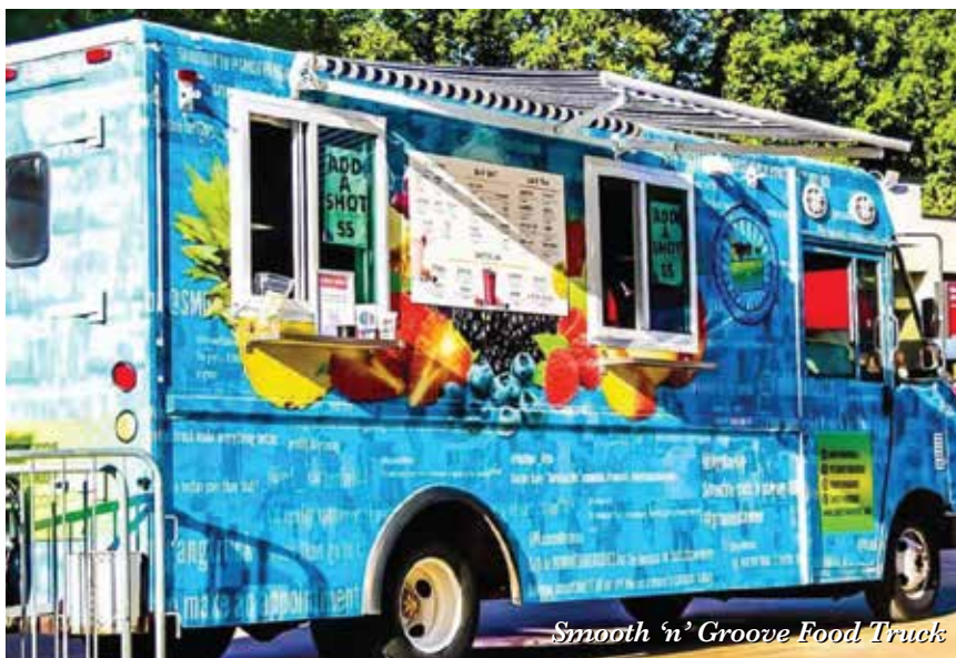
Smooth 'n' Groove Food Truck